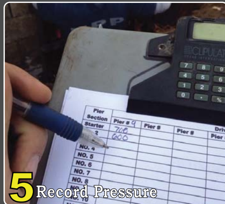
5 Record Pressure