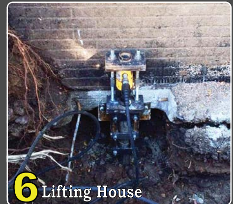
6 Lifting House