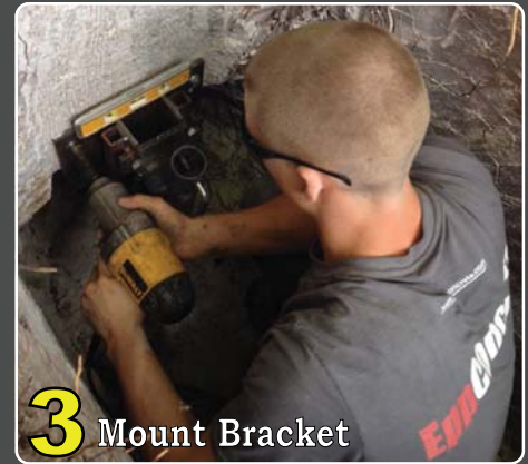
3 Mount Bracket