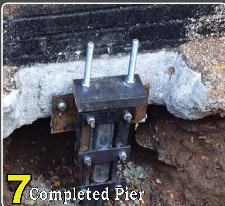
7 Completed Pier