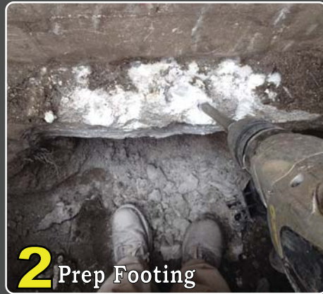
2 Prep Footing