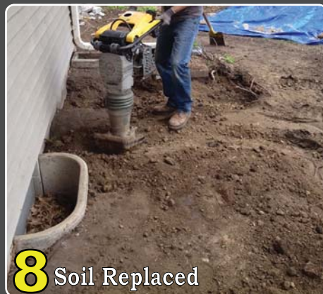
8 Soil Replaced