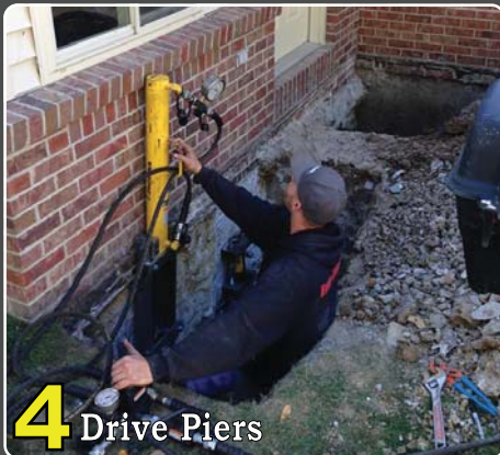
4 Drive Piers