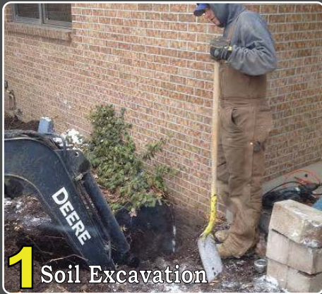
1 Soil Excavation